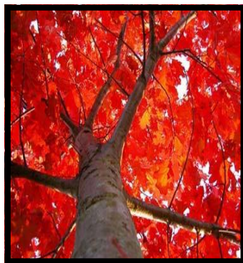
Red Oak: NJ State Tree