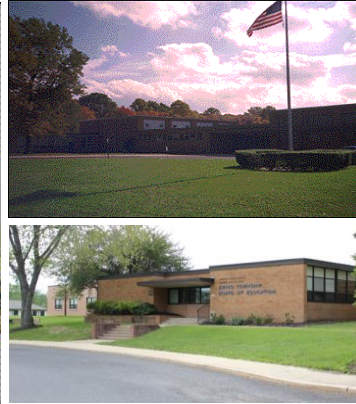
FISHER MIDDLE SCHOOL & O'BRIEN ACADEMY