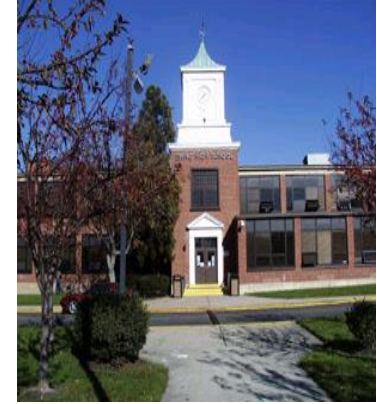
EWING HIGH SCHOOL