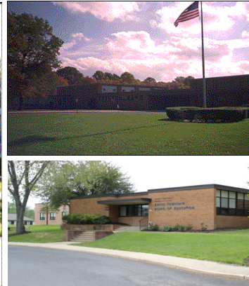
FISHER MIDDLE SCHOOL & O'BRIEN ACADEMY