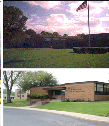
FISHER MIDDLE SCHOOL & O'BRIEN ACADEMY