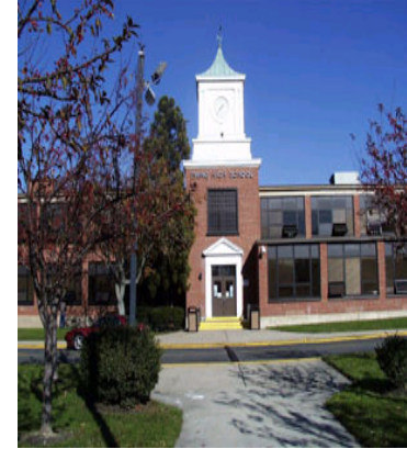
EWING HIGH SCHOOL